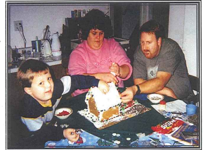
Head Start partners with parents to support their role as the primary decision-makers for their children.